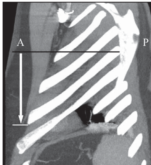
Figure 1. Sagittal CT image of the chest. This reformatted image demonstrates the posterior (P) to anterior (A) descent of the ribs as they wrap around the body. The distance between the 2 lines represented by the arrow is approximately 3 to 5 inches in most individuals.

The respiratory system is composed of the larynx, trachea, bronchi and lungs. The larynx, commonly referred to as the voice box, is the most superior structure in the respiratory system and houses the vocal cords. In close proximity to the larynx are the thyroid cartilage, laryngeal prominence or Adam's apple, and the cricoid cartilage. The epiglottis also is located nearby and acts as a covering for the trachea when food is swallowed. The trachea descends inferiorly beginning at about the level of C5 to approximately T5 or T6, where it bifurcates at the carina into the right and left primary bronchi. The bronchi then subdivide into several branches. Three secondary branches feed the right lung and 2 secondary branches feed the left lung. These branches divide into tertiary levels and smaller segments, eventually ending in the terminal bronchioles where the alveoli exchange oxygen and carbon dioxide. 2